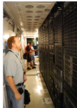
Inside the HP POD

Within the POD are twenty-two 19-inch standard 50U racks providing 1,100U of rack space. The racks can hold up to 160 servers each for a POD total of 3,520 servers. Being standard racks, any vendor's equipment designed for these racks may be used, including servers from IBM, Dell, and Sun and networking gear from Cisco. Alternatively, a POD can be configured with up to 12,000 hard drives, providing total storage of 12,000 petabytes. Any combination of servers, storage, and network equipment may