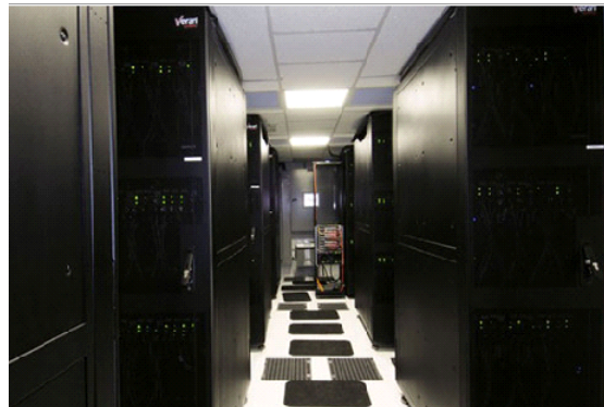
Inside a Microsoft Data-Center Container

Microsoft needs this capacity. Its data-center requirements are growing at a rate of 10,000 servers per month, and this rate is projected to grow to 20,000 servers per month in the coming years.