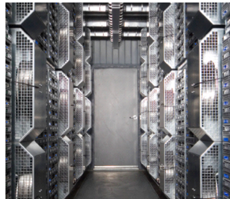
Rackable's Central Aisle

Rackable System's ICE Cube ( www.rackable.com ) comes in a 20-foot or a 40-foot shipping container designed to house its half-depth server rack systems. As such, it is not compatible with equipment from other manufacturers. However, because of the half-depth form factor of Rackable servers, ICE Cube provides significantly more rack space.