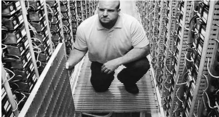
Inside a Google Data-Center Container

Because the data center is so compact, great efficiencies can be made in cooling, a major energy consumer. Rather than having to move cold air across a large data center room and having it mix with warm air on its way, cold air only has to move a few feet and can be easily separated from the hot return air.